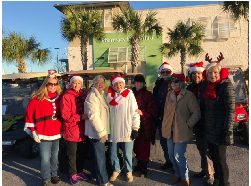
Santa's helpers are ready to get to work!