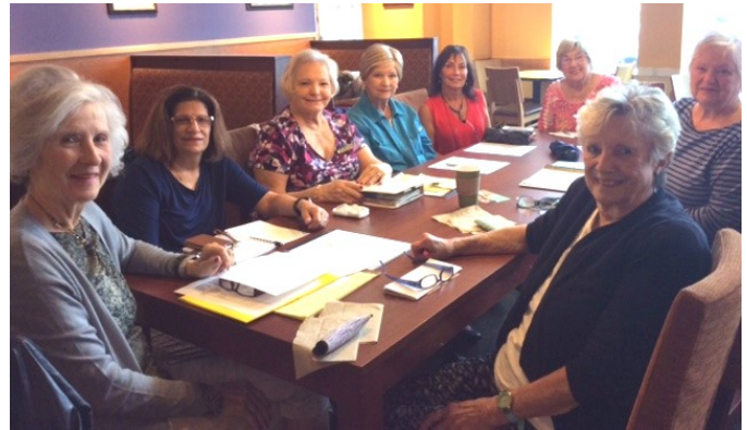
The Dance Committee is seen above at their planning session which was held at Panera Bread recently.